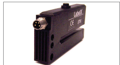
Industry standard connector, wiring and mounting configuration

WARRANTY EMX INC. the product described herein for a period of 2 years under normal use and service from the date of manufacture. The product will be free from defects in material and workmanship. This warranty does not cover ordinary wear and tear, abuse, misuse, overloading, altered products, or damage caused by the purchaser from incorrect connections, or lightning damage. There is no warranty of merchantability. There are no warranties expressed, implied or any affirmation of fact or representation which extend beyond the description set forth herein. EMX Inc. sole responsibility and liability, and purchaser's exclusive remedy shall be limited to the repair or replacement at EMX's option of a part or parts not so conforming to the warranty. In no event shall EMX Inc. be liable for damages of any nature, including incidental or consequential damages, including but, not limited to any damages resulting from non-conformity defect in material or workmanship.